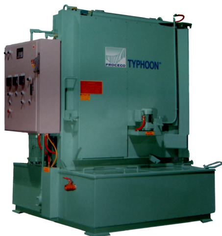
TYPICAL CABINET JET WASHER