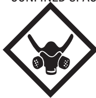
NIOSH APPROVED ACID VA- POUR RESPIRATOR