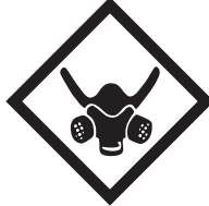
NIOSH APPROVED ACID VAPOUR RESPIRATOR

Corrosive To Metals: Category 1 Acute Toxicity: Category 1 & 2 Skin Corrosion/Irritation: Category 1A Eye Damage/Irritation: Category 1