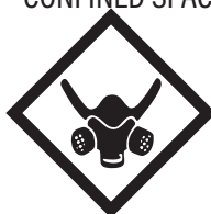
NIOSH APPROVED ACID VAPOUR RESPIRATOR

Acute Toxicity (Dermal)—Category 1 Acute Toxicity (Inhalation)—Category 1 Acute Toxicity (Oral)—Category 1