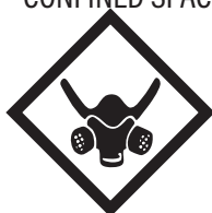
NIOSH APPROVED ACID VAPOUR RESPIRATOR

Corrosive To Metals: Category 1 Acute Toxicity: Category 1 & 2 Skin Corrosion/Irritation: Category 1A Eye Damage/Irritation: Category 1